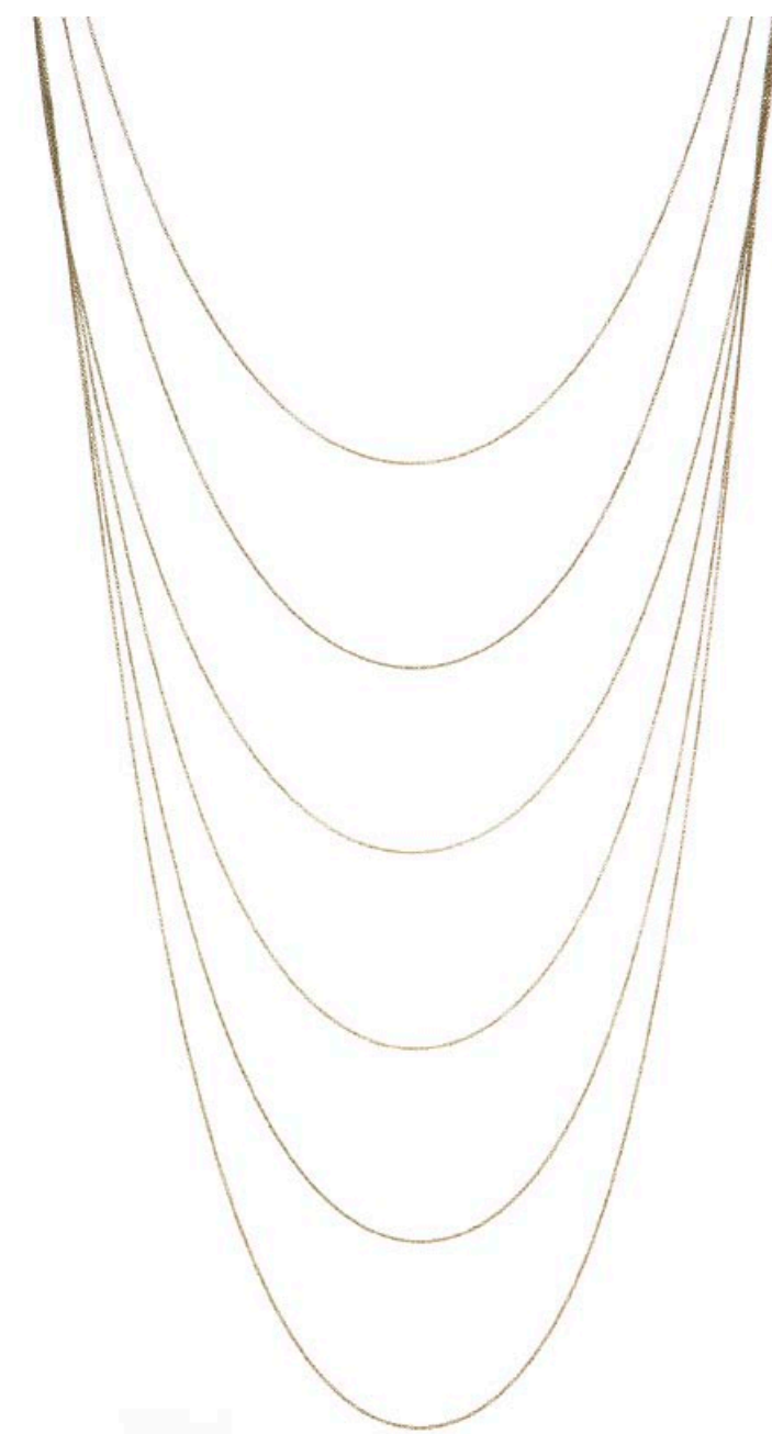
Color: 18kt Vermeil