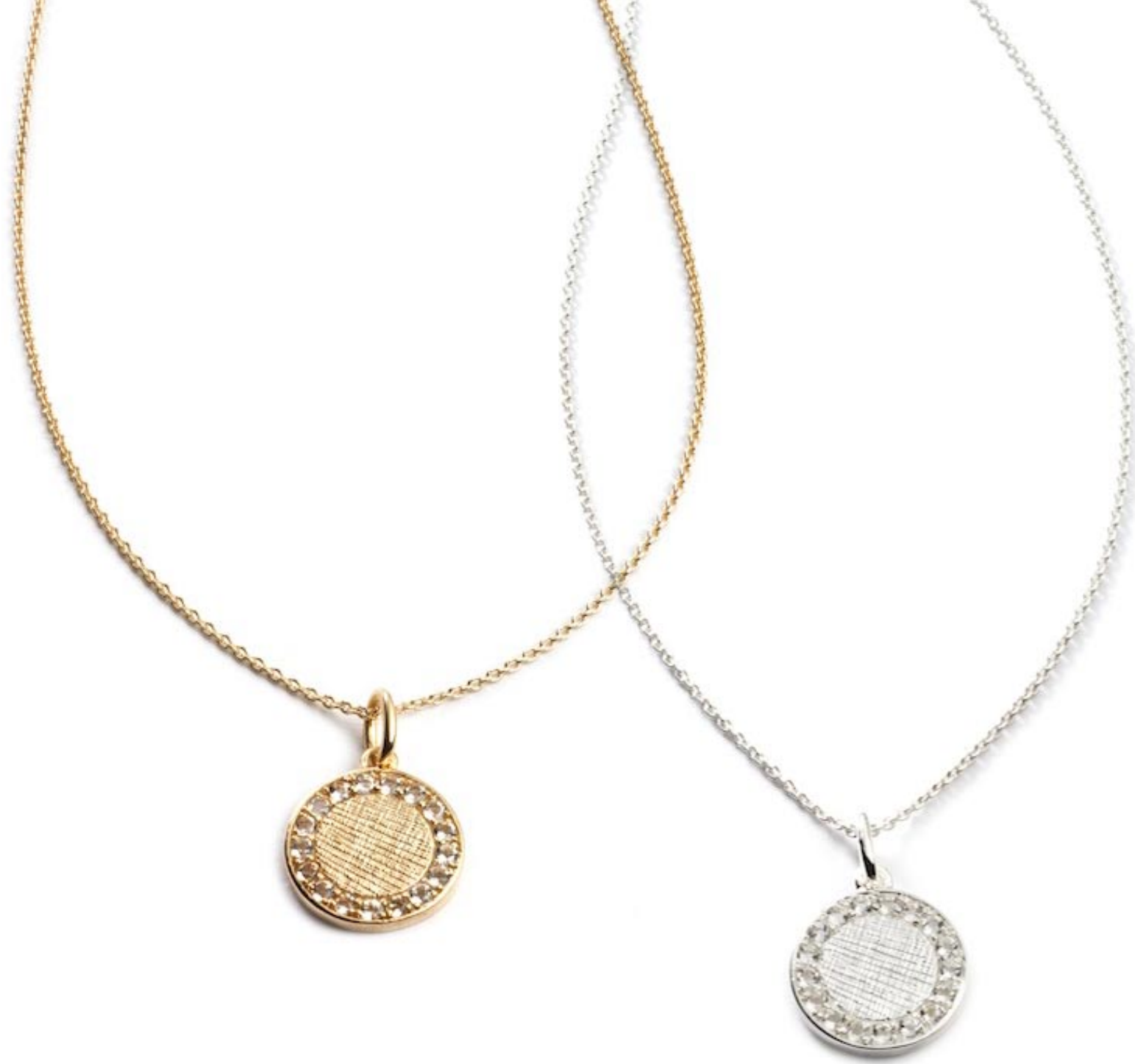
*Maia Necklace in White Quartz