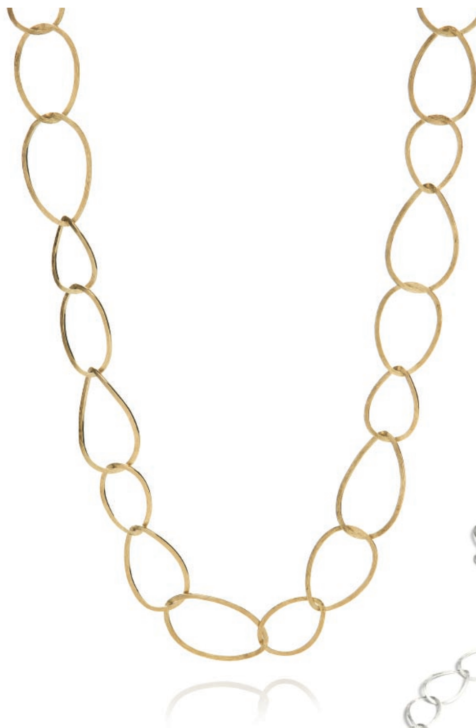
PEITHA NECKLACE 30" organic large hoop necklace. Hoops vary in size and shape