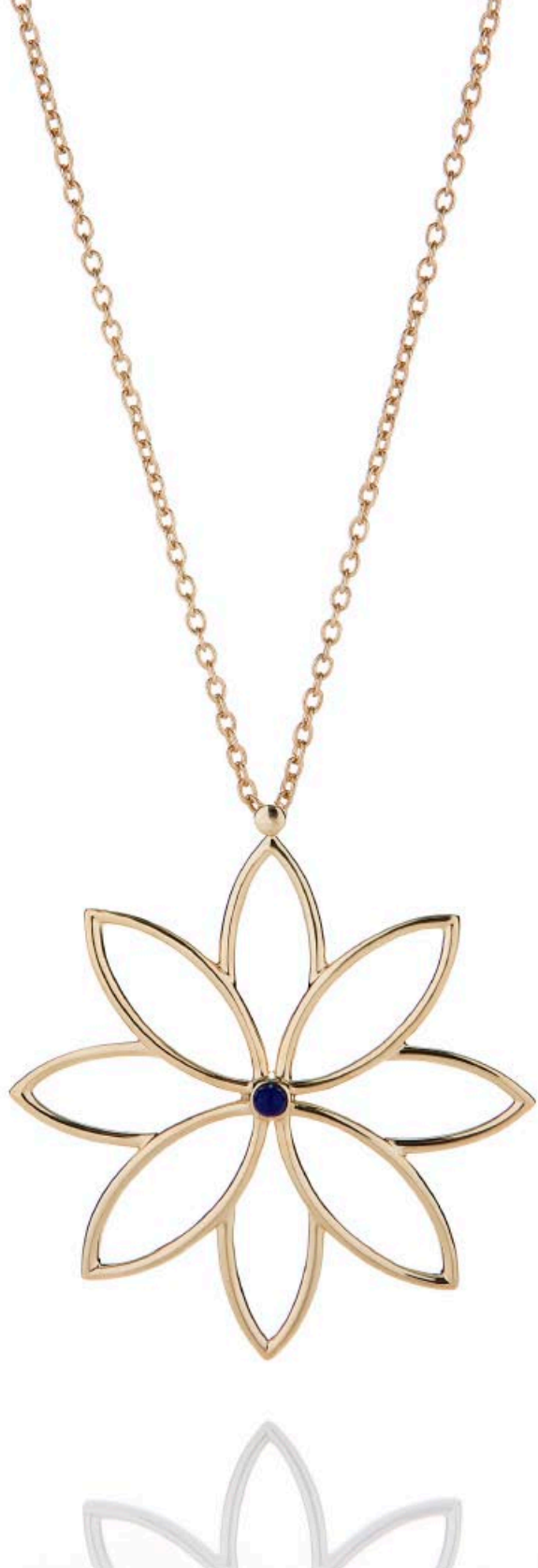
FLORA NECKLACE 32" long, thick circle chain, with 1.5" delicate Vermeil/Silverflower