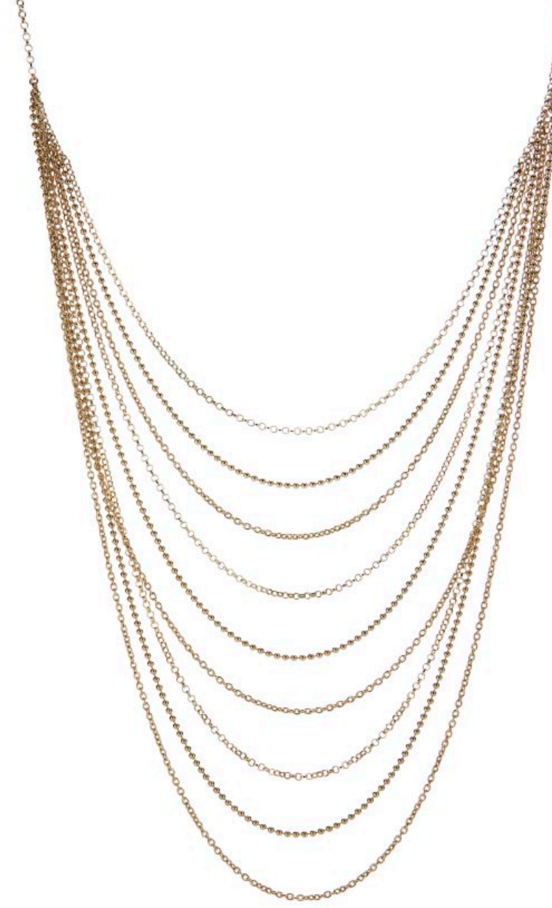
Color: 18kt Vermeil